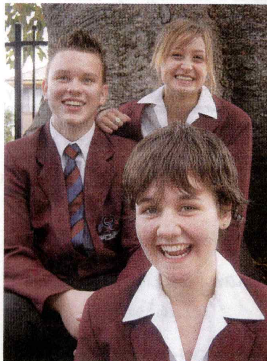
Callaghan College Waratah Technology Campus

Come back to our school and join in the celebrations