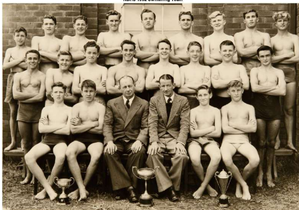
Senior and Junior C.N.H.S. Champions